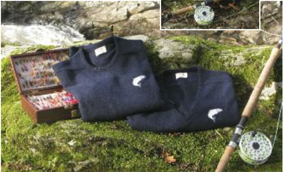
Navy V-neck & Crew-neck Sweaters 36" to 50" @£55ea (ex postage)