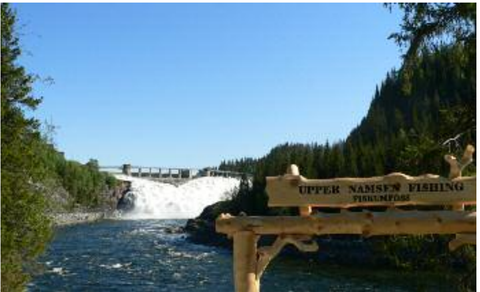
Fiskum Fall, Upper Namsen.