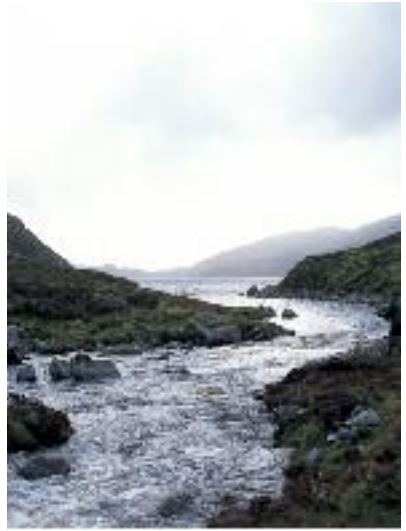
Uig & Hamanavay.