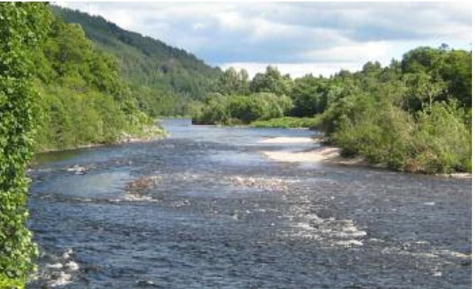
River Tay at Dunkeld.