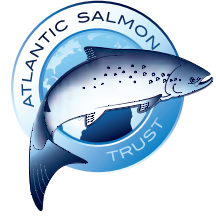
AST Ties (dark or mid blue) Silk or Polyester Silk Headscarves