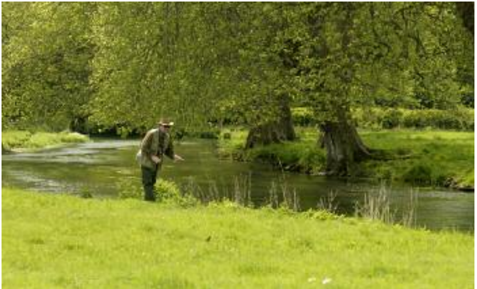
River Avon, Wiltshire.